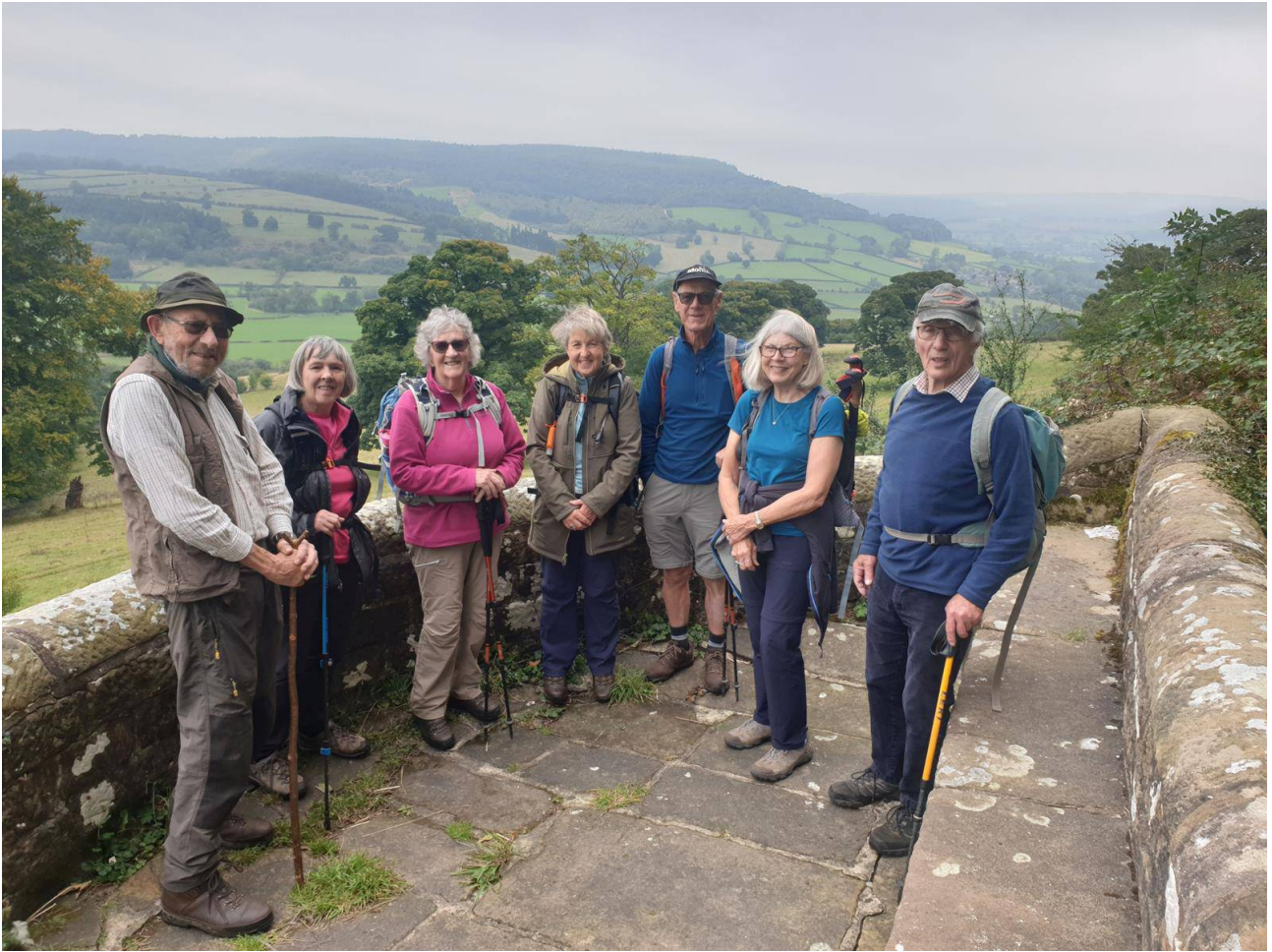
Enjoying stunning views on the Rowsley – Stanton road.