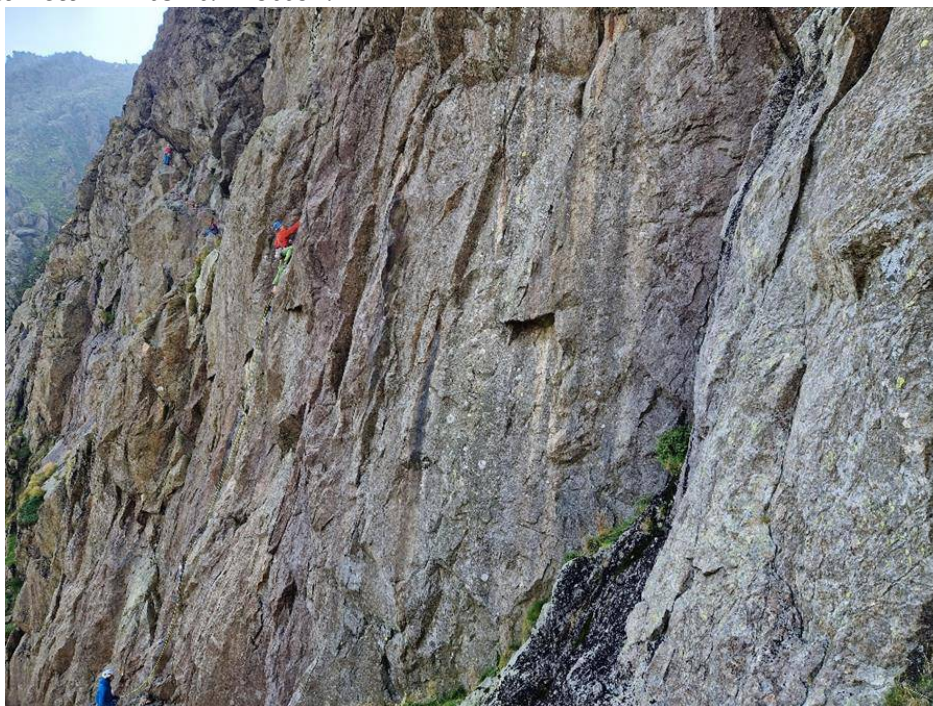
Holocaust after the crux.

"Who's doing the second pitch," I asked, knowing the answer. There was some more spice at the start of the second pitch, with another potential Desmond from tricky moves. The gear and the moves both improved after that until you reach the righthand side of a little grassy ledge. This is supposedly an optional belay, but I pressed on. A chunky layback allows you to step up onto a good foot ledge. There's an old, jammed wire under the overlap. How old is that? I clipped it anyway. A positive left hand layaway/gaston and a good foot edge offered a fairly obvious way to get committed on a righthand layaway and a stretch for an undercut. Hmm. E1? I stepped down and added a low wire. Another rusty, jammed wire beckoned. Switching hands, I found a decent crack and slid a decent small cam into it. Better.