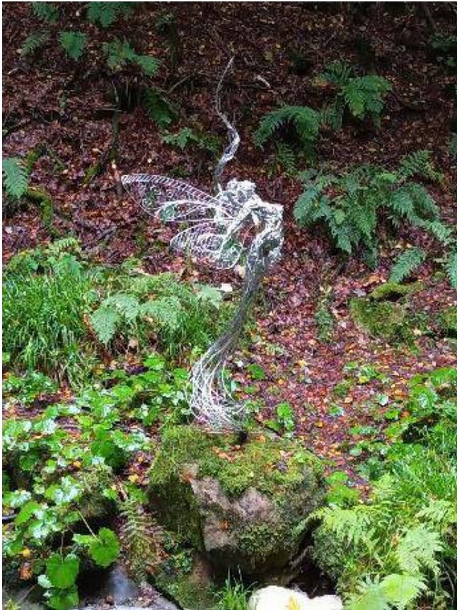
One of the sculptures that adorns Star Bank wood.

that can be found scattered throughout this wooded valley.