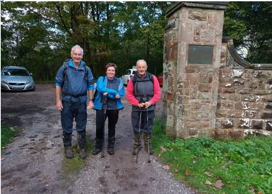
Masefield Memorial Gateway, Hawksmoor Nature Reserve.

conversation revolved around damages of processed food and the merits of home cooking.